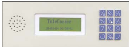
Front with speaker, LCD display, & keypad

2 or 4 channels with built-in hard drive