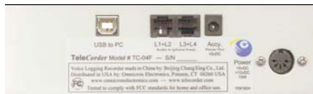
Back with input and output connections Recording list as viewed on a PC